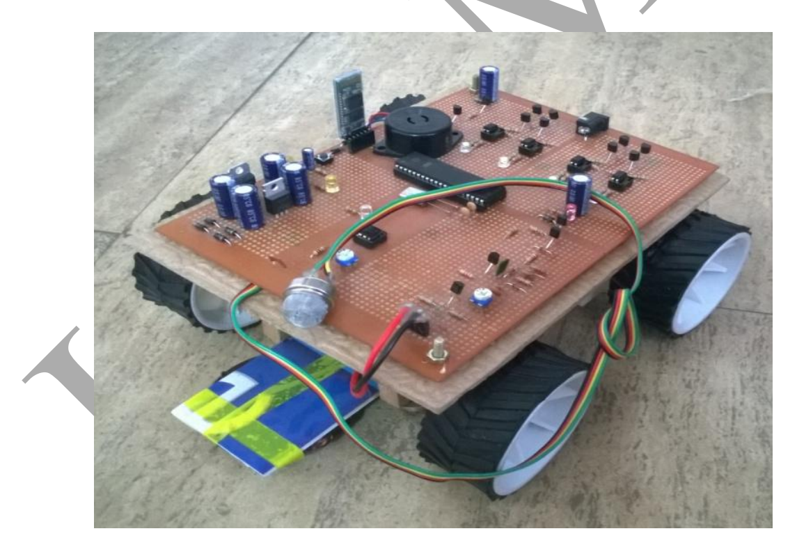
Fig 2: Prototype Design of Landmine and Gas Detector Using Android

As the power supply is given to the device LEDs will glow which indicates that the device is working properly. The Bluetooth module is placed and the app on the phone is opened. The app will scan for the Bluetooth placed on the device. As it detects it then we will connect the phone with the device using this Bluetooth. Now we can move the vehicle forward, backward, left or right. The center button in the app will stop the vehicle. As the vehicle moves in any direction, the white LED will glow indicating the movement is being done. We can turn ON the camera using this same app and this can be indicated by a blue colored LED. The output can now be viewed using a TV or laptop. Now we will move the vehicle towards the target area. As any metal or landmine comes beneath the coil of copper wire which acts as metal detector, the buzzer will start beeping and a red colored LED will start to glow. We can see the location of the landmine using the camera. If any gas leakage is present in the environment then the buzzer will start to beep and a green colored LED will glow. The different colors of LED are used so that we are able to distinguish between the presence of landmine or gas. The principle of detection of gas leakage lies in the comparison of the pressure level of gas formed by oxidation with SnO<sub>2</sub> with that of preset value. The landmine detection is done on the basis of fluctuations of electromagnetic signals back and forth from the surface.